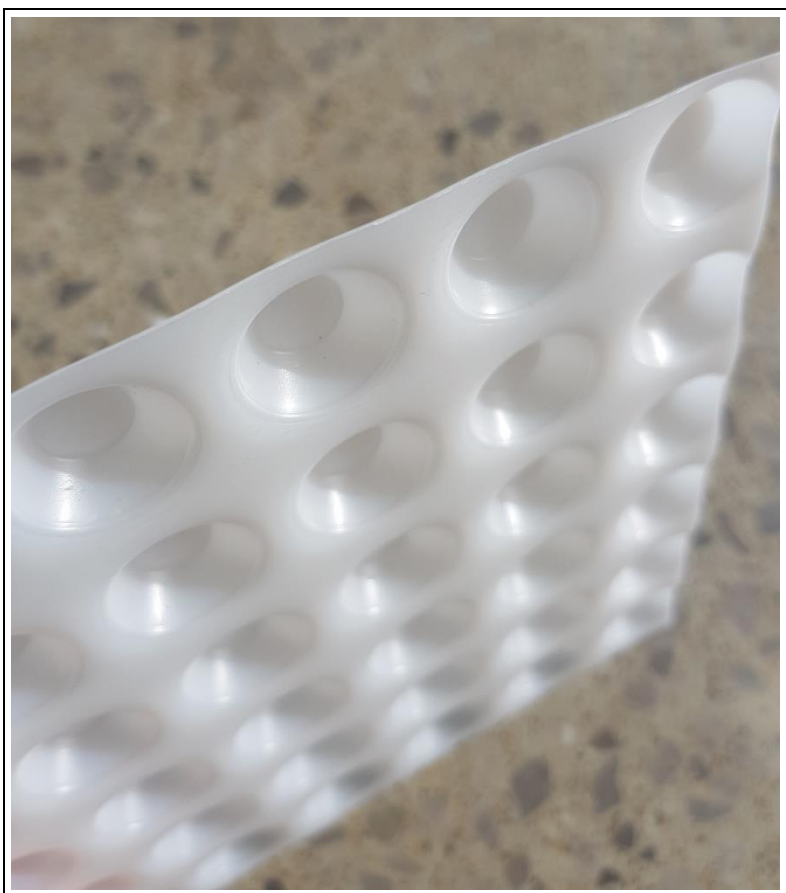
Figure 1 PUDLO CD08

1.2 The product is supplied in roll form, and has the following nominal characteristics: