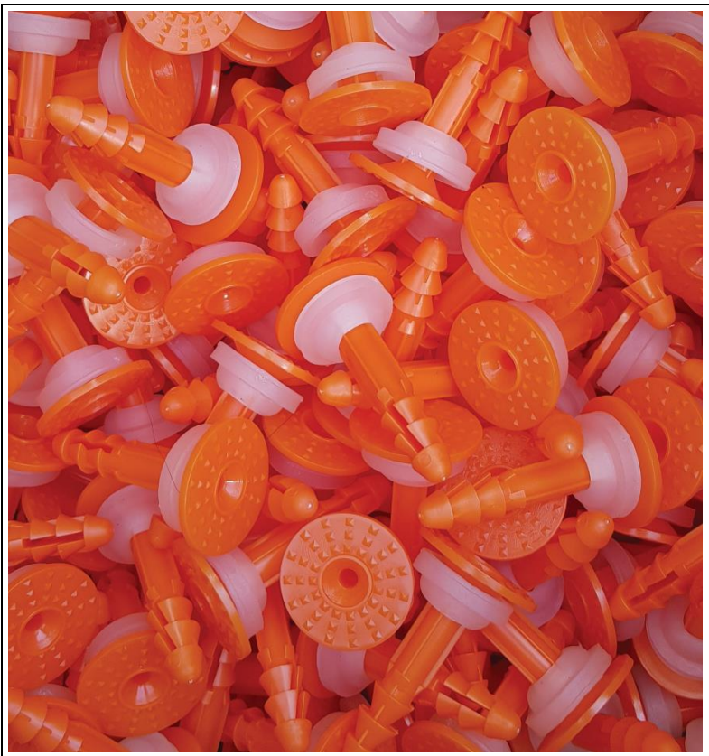
Figure 2 PUDLO CD plug