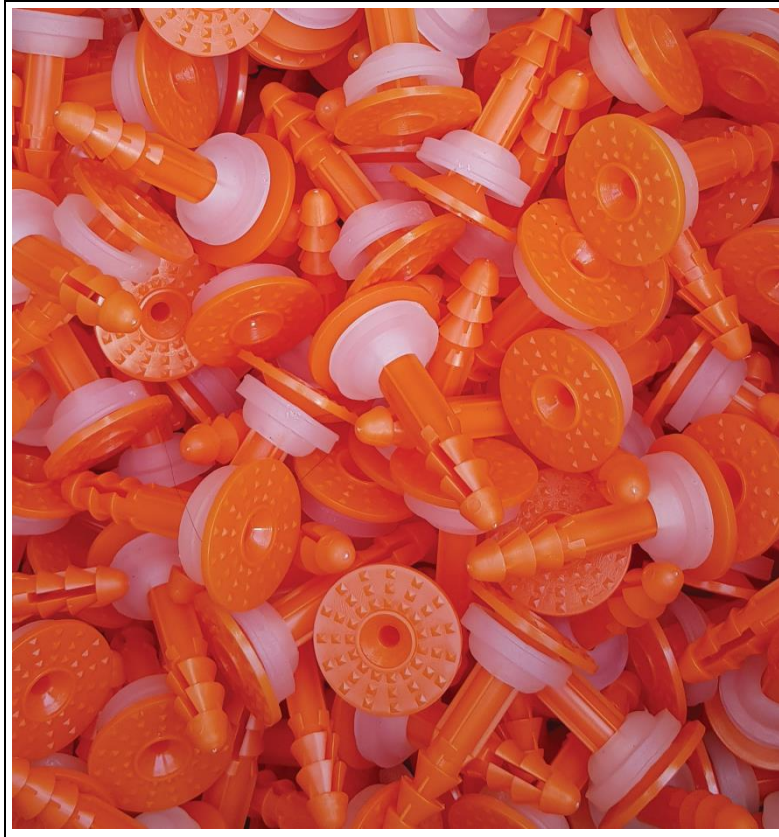
Figure 2 PUDLO CD plug