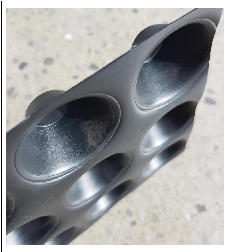
Figure 1 PUDLO CD20

1.2 The product is supplied in roll form, and has the following nominal characteristics: