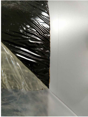
Peel back film, Bitumen/Silver Selvedge to substrate. (THIS SIDE DOWN)